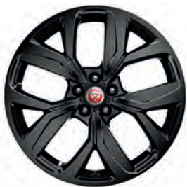
20" 5 SPOKE 'STYLE 5068' WITH GLOSS BLACK FINISH