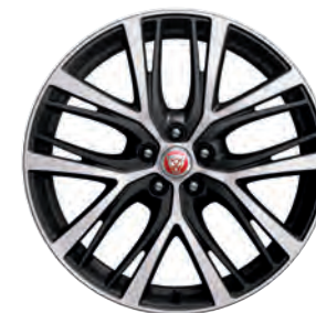
20" 5 SPLIT-SPOKE 'STYLE 5070' IN TECHNICAL GREY WITH POLISHED FINISH

Inside a choice of colourways, Ebony or Light Oyster, are available with an exclusive combination of a suedecloth headlining, Gloss Charcoal Ash First Edition veneer, carpet mats and First Edition branded metal treadplates.