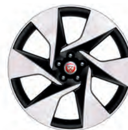
20" 6 SPOKE 'STYLE 6007' WITH DIAMOND TURNED FINISH