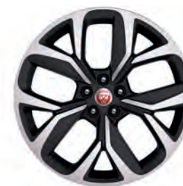
20" 5 SPOKE 'STYLE 5068' WITH DIAMOND TURNED FINISH (Standard on HSE)