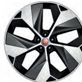
22" 5 SPOKE 'STYLE 5069' IN GLOSS BLACK WITH DIAMOND TURNED FINISH AND CARBON INSERTS