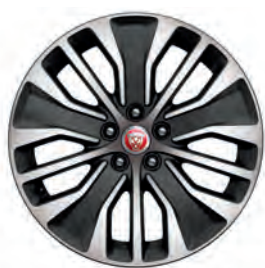
18" 5 SPOKE 'STYLE 5055' WITH DIAMOND TURNED FINISH