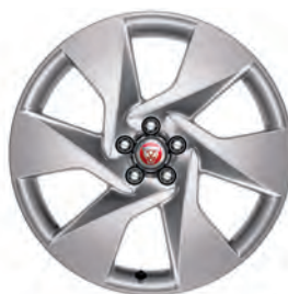
20" 6 SPOKE 'STYLE 6007' (Standard on SE)