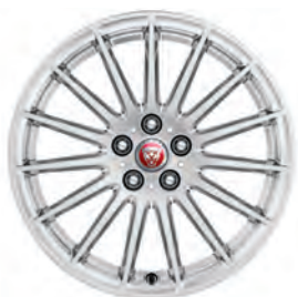
18" 15 SPOKE 'STYLE 1022' (Standard on S)