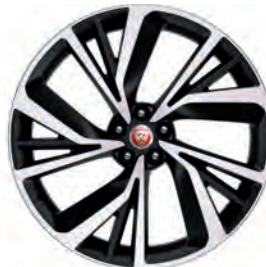
22" 5 SPLIT-SPOKE 'STYLE 5056' WITH DIAMOND TURNED FINISH