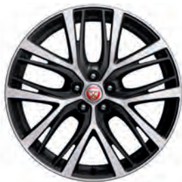
20" 5 SPLIT-SPOKE 'STYLE 5070' IN TECHNICAL GREY WITH POLISHED FINISH (Standard on First Edition)